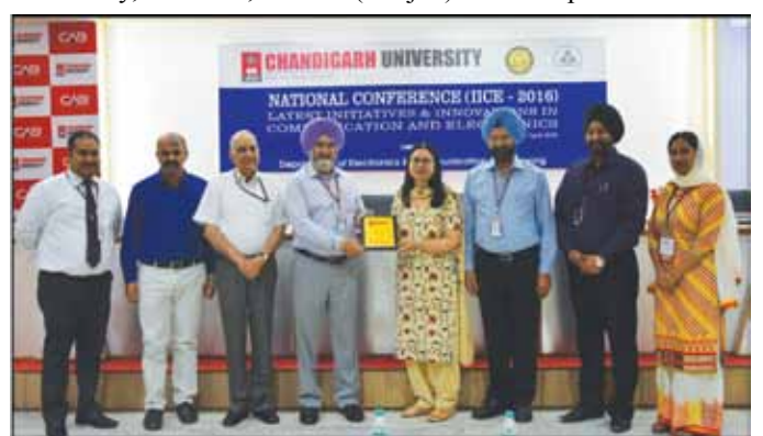
Dignitaries on the dais during the National Conference

◆ A National Conference on "Latest Initiatives & Innovations in Communication and Electronics (iice2016)" was jointly organized by the Centre and the Chandigarh University, Gharuan, Mohali (Punjab) on 29<sup>th</sup> Apr 2016.