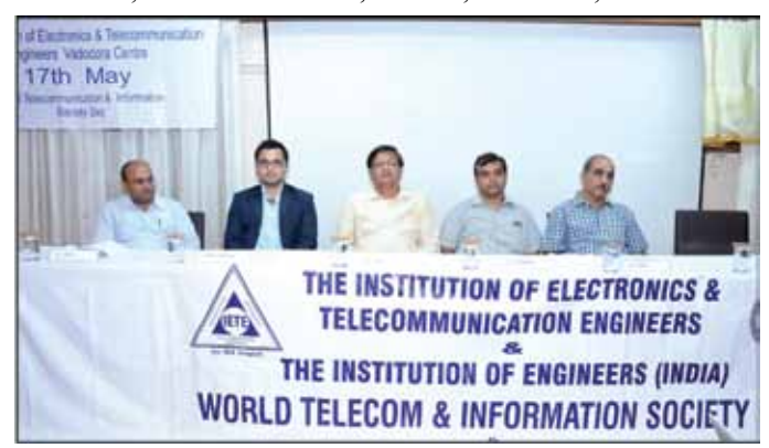
IETE Vadodara Centre commemorating 48th WTISD 2016