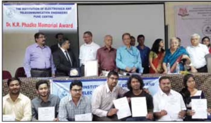
Dignitaries on dais and winners of the project competition off the dais